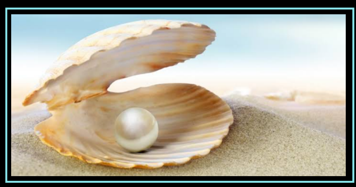
Who makes pearls and why?