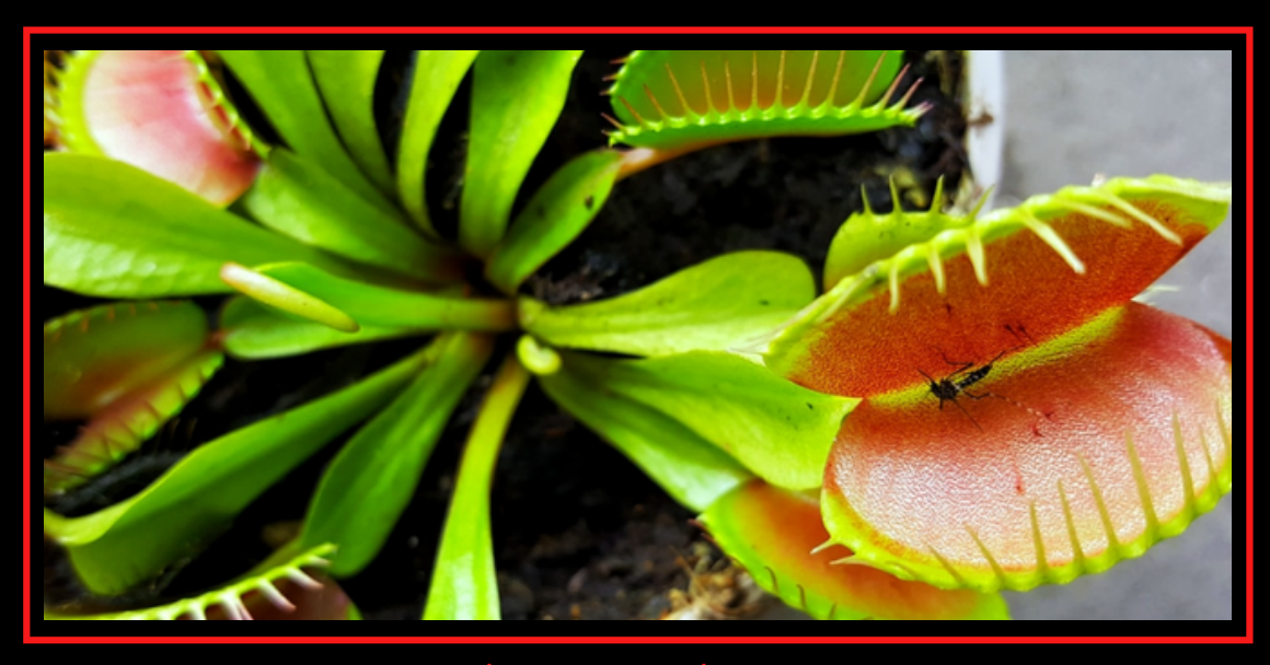
The Venus Flytrap