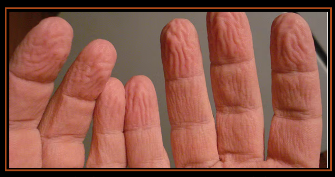
Why fingers kept in water turn wrinkled?