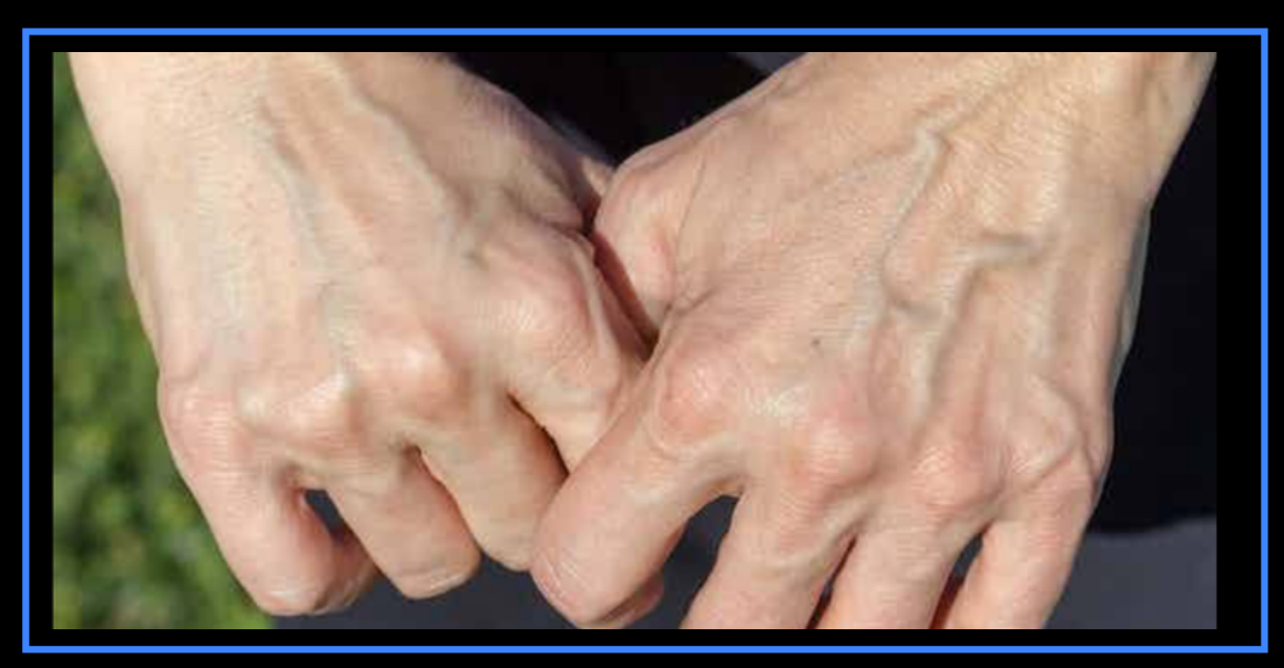
Why do veins appear blue?