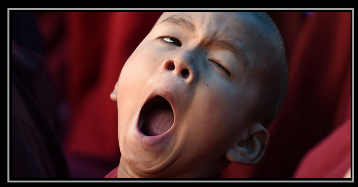
Why do we yawn?