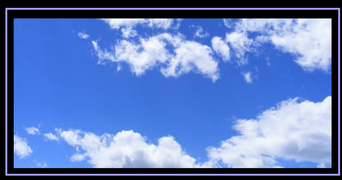
Why does the sky appear blue?