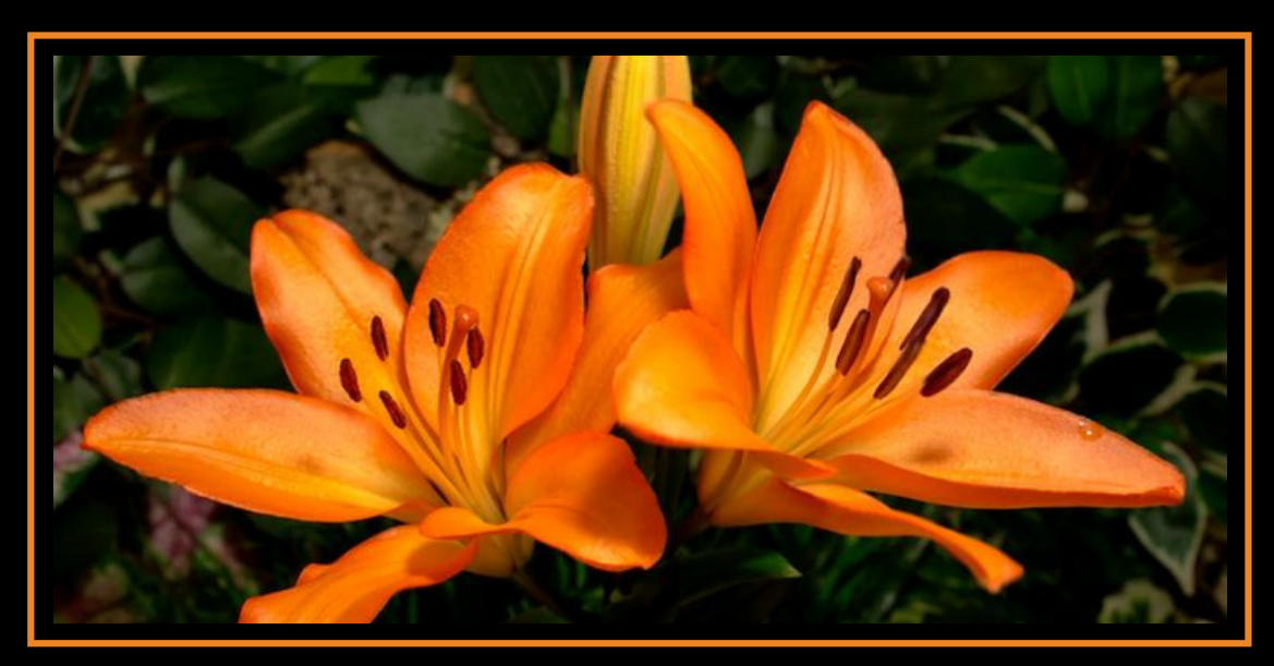
How do flowers bloom?