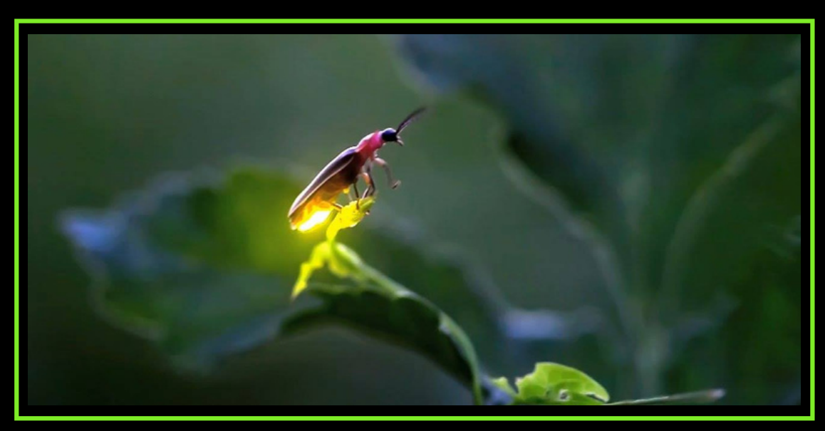
Why do certain animals glow in the dark?