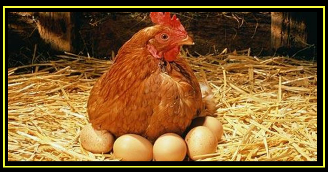
Do we eat fertilized or unfertilized eggs?